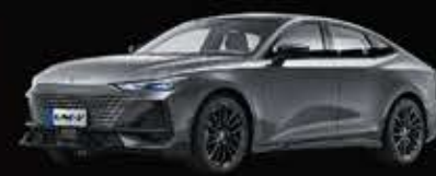
MODERN CONCRETE GREY