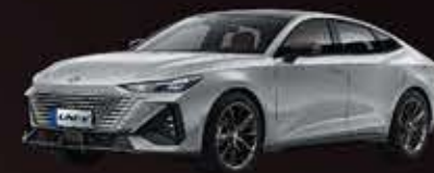
DAZZLE SHADOW GREY